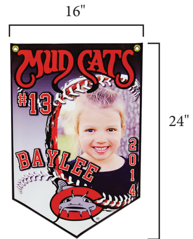
VERTICAL PENNANT BANNER

WARNING: Cancer and Reproductive Harm- www.P65Warnings.ca.gov