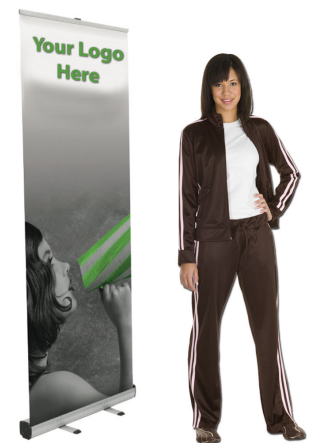
CUSTOM RETRACTABLE BANNER DISPLAY WITH STAND